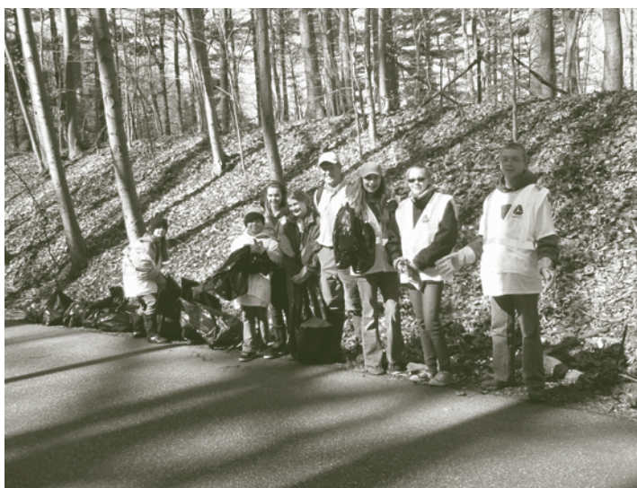
Students from the RCVA/DNS Young Waterfowler's partnership program collecting trash along Hoopes Reservoir.

The success of this clean up is due to the generous financial and in-kind support from our partnering non profit organizations and local businesses; and also the support of the 613 volunteers who turned helped that Saturday morning.